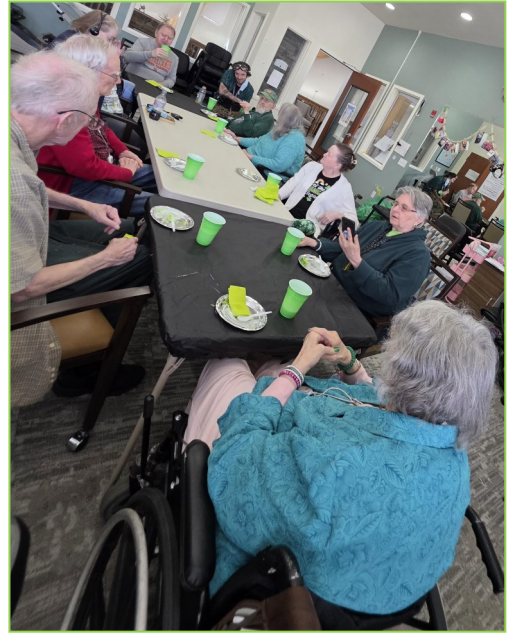
Happy St. Patrick's Day