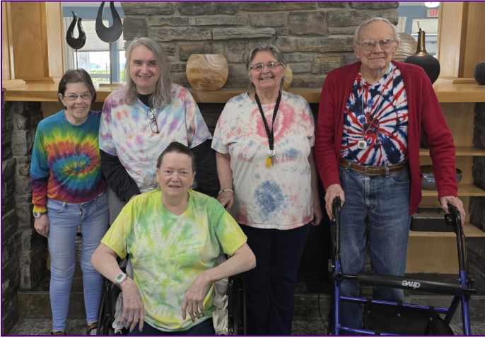
Tie Dye Day