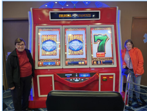
Spirit Mountain Casino!