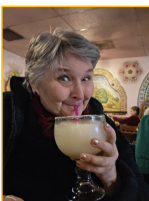
Out to lunch at El Sol De Mexico