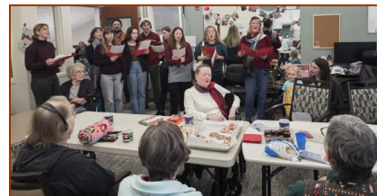
Christmas Eve Carolers