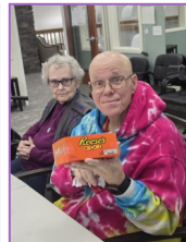
Secret Santa Gift Exchange