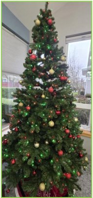
Decorating the Christmas Trees