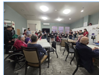
St. Mary's High School Group