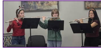
Casa Musica performance