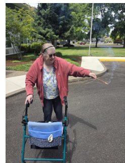
Fun with Fireworks