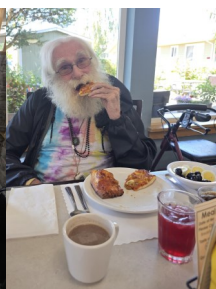
Impromptu Pizza Party