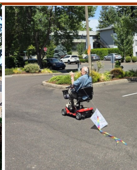
Trying to fly a kite