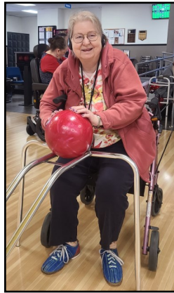
Left - Out for an afternoon of bowling