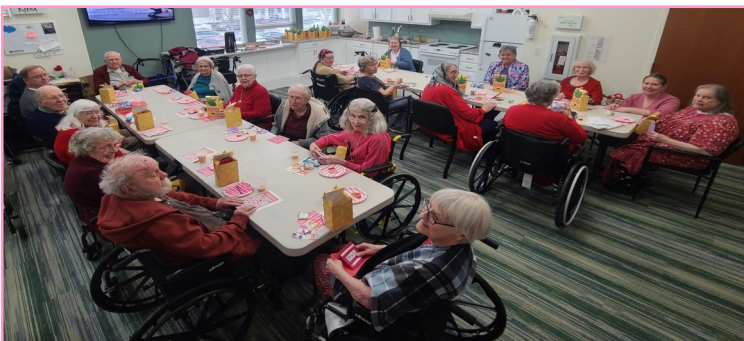
Below - Valentine's Day Party